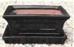
Shiny Black (+10%)

Besides the below available colors, more color choices can be made from the attached Color Chart