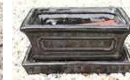
Blossomed Black (+10%)