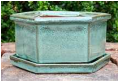
Moss Green (+5%)