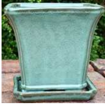
Moss Green (+5%)