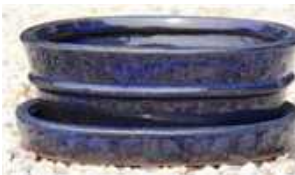
Shiny Black (+10%)