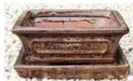
Blossomed Brown (+5%)