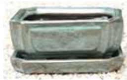
Moss Green (+5%)