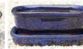
Avocado (+10%) Jade Green