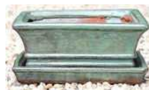
Moss Green (+5%)