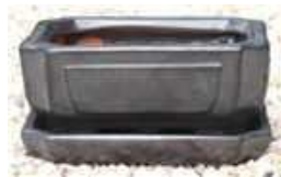
Blossomed Black (+10%)

Besides the below available colors, more color choices can be made from the attached Color Chart