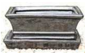
Blossomed Black (+10%)

Besides the below available colors, more color choices can be made from the attached Color Chart