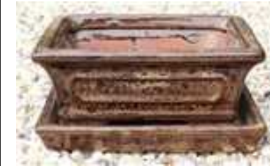
Blossomed Brown (+5%)