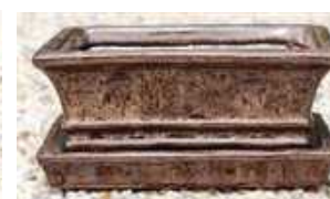
Blossomed Brown (+5%)