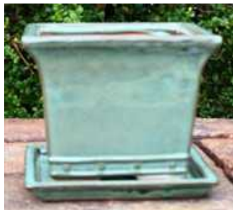
Moss Green (+5%)