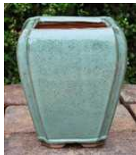
Moss Green (+5%)