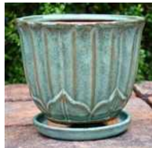
Moss Green (+5%)