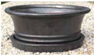
Shiny Black (+10%)

Besides the below available colors, more color choices can be made from the attached Color Chart