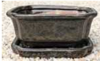
Blossomed Black (10%)