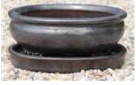
Shiny Black (+10%)