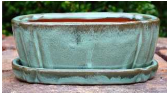
Moss Green (+5%)