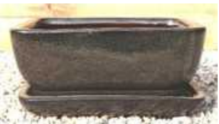
Blossomed Black (+10%)

Besides the below available colors, more color choices can be made from the attached Color Chart