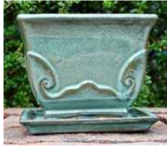
Moss Green (+5%)