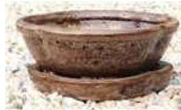
Blossomed Brown (+5%)