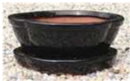
Shiny Black (+10%)

Besides the below available colors, more color choices can be made from the attached Color Chart