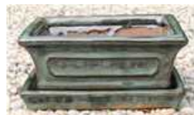
Moss Green (+5%)