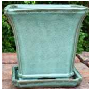
Moss Green (+5%)