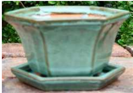
Moss Green (+5%)